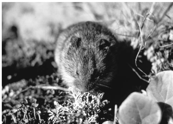
Fig. 1.—An adult Microtus miurus miurus from Alaska.