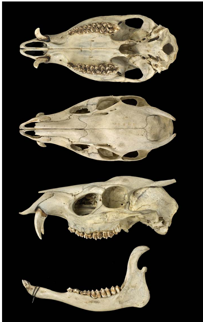
Fig. 3. —Ventral, dorsal, and lateral views of skull and lateral view of mandible of an adult male Elaphodus cephalophus (The Natural History Museum, London, specimen 11.9.8.44); upper canines, particularly large preorbital openings, and reduced and convergent antler pedicels (on males only) are characteristic. Greatest length of skull is 196.0 mm.