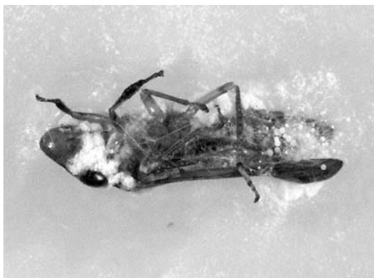
Fig. 1. Mycelia of Pseudogibellula formicarum emerge from dead glassy-wing sharpshooters collected from the treated samples after 4 days incubation at 27 ± 1°C, 85% RH. The sharpshooters were surface-sterilized and plated on SMAY to investigate the recovery of the fungus.

epizootics. However, additional studies are need to provide a better understanding of host-pathogen interactions, and identify the factors that enhance or limit disease increase in sharpshooter populations under natural conditions. In addition, the sharpshooter was found to be also a suitable host for Metarhizium anisopliae . Overall, P. formicarum and M. anisopliae could provide new avenues for the biological control of the glassy-winged sharpshooter and complement current control strategies.