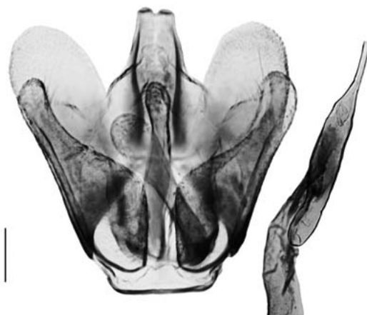
Fig. 2. Male genitalia of Leptodeuterochopus neales ; (same data as Fig. 1), slide DM 334. Scale line = 0.1 mm.

(Walker). The wingspan of S. anisodactylus is 12.0-18.0 mm (Matthews 1989), while that of L. neales is about 9.0-11.0 mm. The forewing of L. neales has a distinct pale band across the basal third of each lobe, contrasting the coppery base color. In S. anisodactylus , this pale band is narrower and does not extend to the cleft base. Unlike the type species, Leptodeuterochopus citrogaster Fletcher, there is no second cleft apparent on the second forewing lobe of L. neales .