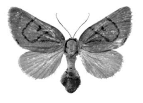
Fig. 1. Camptoloma kishidai sp. nov. : Female, holotype, upperside.

Antemedian, postmedian and discocellular fasciae distinct and well defined, the former two straight, nearly parallel to each other, and with their lower ends connected by a longitudinal dark fascia; discocellular fascia short, curved inwardly, placed nearer to antemedian fascia than to postmedian fascia; submarginal fascia obsolete, traceable; longitudinal fascia on the lower basal wing straight and with its distal end nearly arriving the lower part of antemedian fascia; marginal fascia and tornal reddish patch that represented in other Camptoloma species completely untraceable; cilia orange red. Hindwing ground color