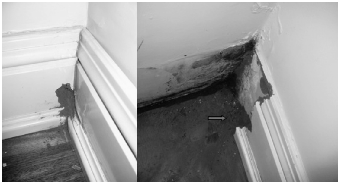
Fig. 1. Skirting board showing fresh wood dust with adult beetles.

There is no previous evidence of Hexarthrum exiguum occurring in Turkey (e.g., Schimitschek 1944); and we now add this species to the entomofauna of Turkey.