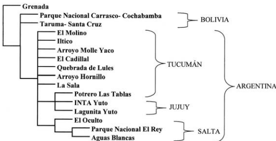
Fig. 2. Strict consensus tree of An. pseudopunctipennis from localities in Argentina (Salta, Jujuy and Tucumán) and Bolivia.

In the cladistic analysis six equally parsimonious trees were obtained of 4,608 steps in length, with consistency and retention indices of 0.91 and 0.82, respectively. The strict consensus of these trees (Fig. 2) depicts the Bolivian populations (Tarumá and Parque Nacional Carrasco) as more basal (ancestral), sister of the node that includes all the Argentinean populations (Salta, Jujuy and Tucumán) consisting of a polytomy that includes 7/8 of the Tucumán localities (Arroyo Mole Yaco, El Cadillal, Quebrada de Lules, El Molino, Iltico, Arroyo Hornillo and La Sala), a clade that includes a mixture of Jujuy (INTA Yuto and Lagunita Yuto) and Tucumán (Potrero Las Tablas) localities and finally a clade that contains the Salta localities (El Oculito, Parque Nacional El Rey and Aguas Blancas).