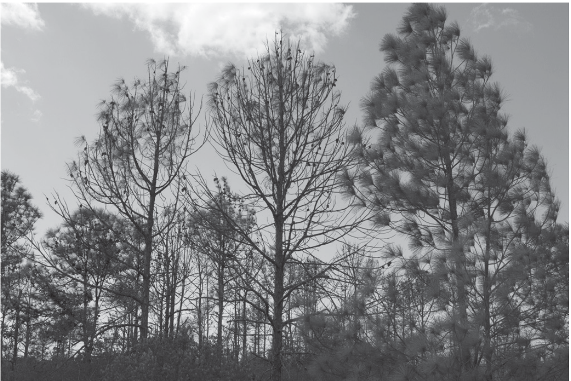
Fig. 1. Caribbean pine trees on North Caicos, Turks and Caicos Islands—range of damage caused by pine tortoise scale.