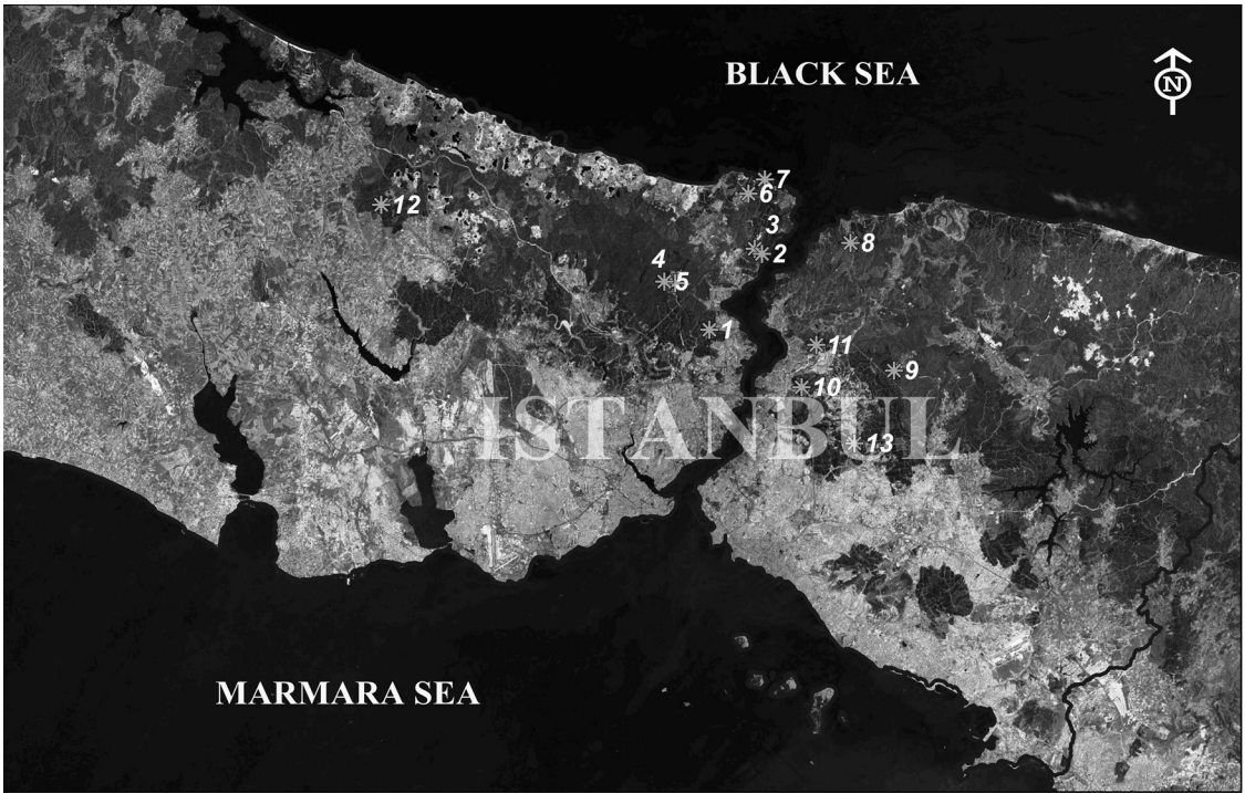
Fig. 1. Leptoglossus occidentalis (western conifer seed bug) distribution in Istanbul Province, Turkey. This invasive species was found on Pinus nigra , Pinus pinea , Pinus radiata and Abies concolor .