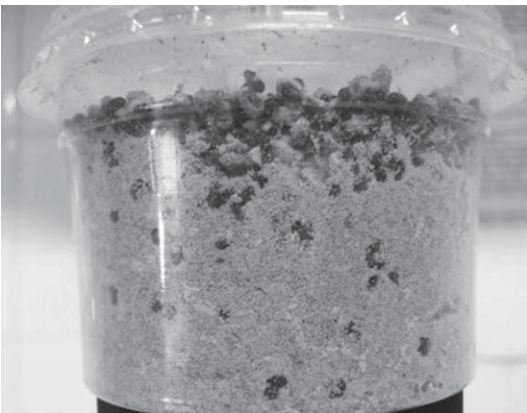
Fig. 2. Container with dehydrated pollen with a heavy infestation by the cigarette beetle, Lasioderma serricorne (Coleoptera: Anobiidae).

Insect contamination was observed in dehydrated bee pollen from Neópolis, Pacatuba, Brejo Grande and Estância municipalities which had a water content > 8% (Table 1).