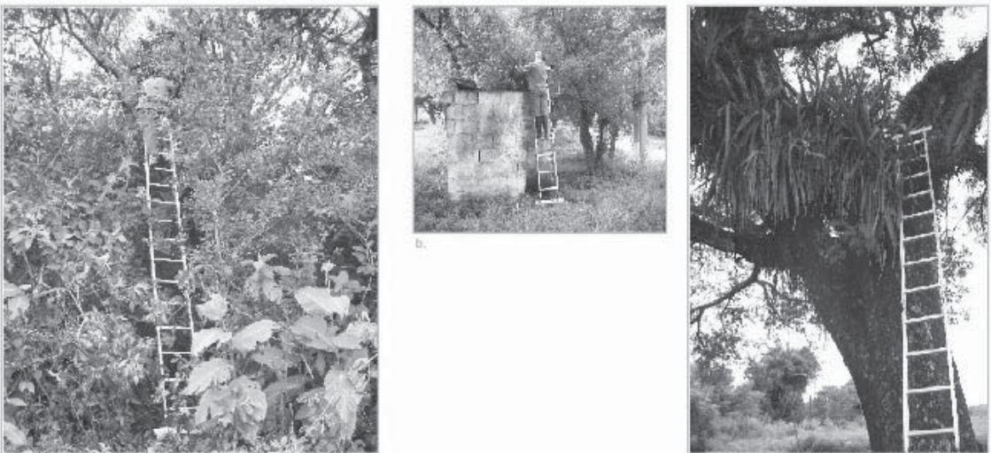
Fig. 2. Mosquito habitats provided by the Aechmea distichantha , a bromeliad epiphyte in the Yungas of north-western Argentina. (2a) Aspect of residual primitive forest in Monte Bello, meters from bromeliads where larvae of Ae. aegypti were found. (2b) Aspect of the abandoned building where epiphytic bromeliads were found from which the larvae of Ae. aegypti were collected. (2c) Epiphytic bromeliads from which larvae of Ae. aegypti and Cx. quinquefasciatus were collected at Iltico.

and Cx. quinquefasciatus in bromeliads located in wild and semi-urban environments could indicate a possible degree of invasion and adaptation to the primitive forest, or they may be a consequence of high infestations levels in nearby houses (Malta Verajao et al. 2005). This finding requires in-depth studies to reveal the real behavior of these