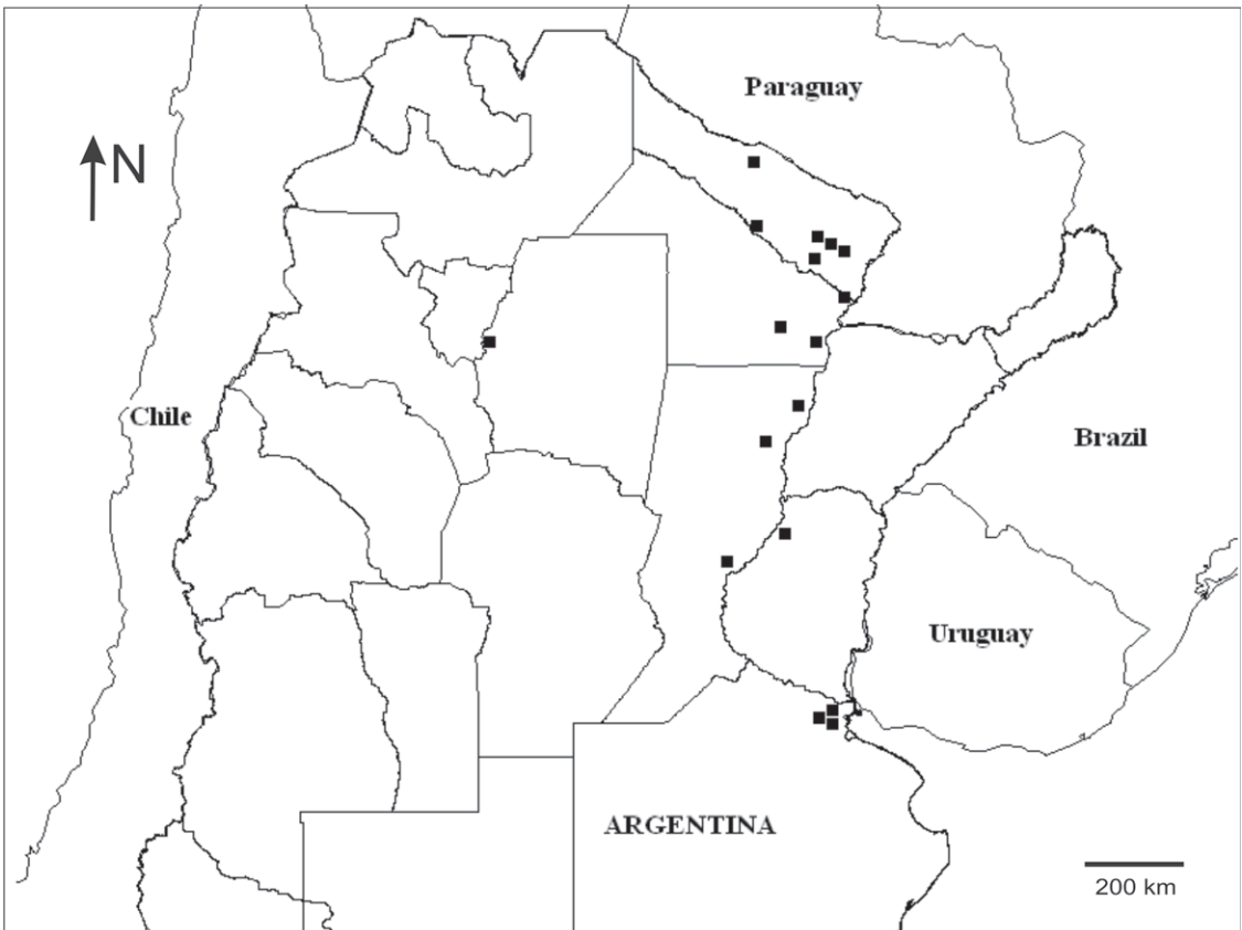
Fig. 11. Map of Argentina with collection sites for Lepidelphax pistiae gen. et sp. nov. (black squares).

Male: Small to medium-sized, predominantly brachypterous forms.