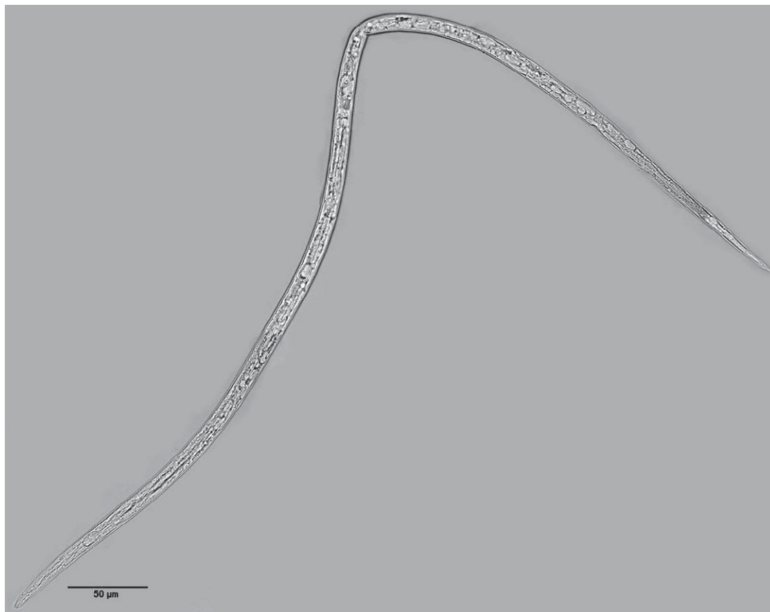
Fig. 3. Adult female nematode (unidentified member of Aphelenchoididae) found inside Rhynchophorus palmarum , polarization optics.

mite workers foraging there. The association of R. rainai and R. palmarum could be an inverse association from that of the B. cocophilus -termite association from a habitat that supports diverse invertebrates.