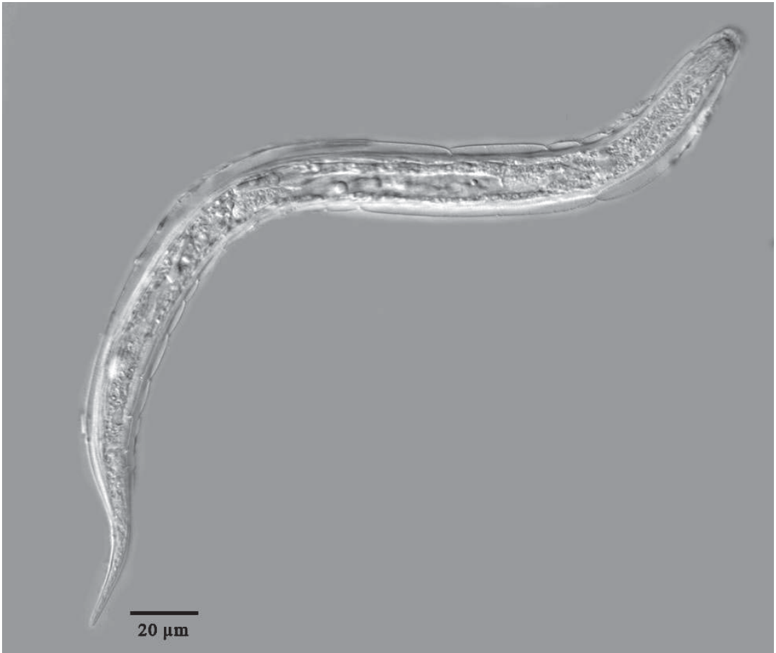
Fig. 4. Dauer juvenile diplogastrid nematode (Unidentified Rhabditida) from Rhynchophorus palmarum showing bunched, sticky outer cuticle, differential interference contrast optics.

marum can be easily established in subtropical environmental conditions, especially with the presence of the wide variety of host plants found in the Lower Rio Grande Valley including several ornamental palms, coconut and oil palms, and sugarcane. Secondly, if R. palmarum does become successfully established, it could be moved to the rest of the southern U.S., affect the ornamental palm industry, and infest and negatively impact sugarcane plantations in South Texas, Louisiana, and Florida. Finally, this weevil is a vector of red ring nematode B. cocophilus , which causes red ring disease that is lethal to many palm tree species, and that further increases economic damage to commercial palm plantations and urban landscapes.