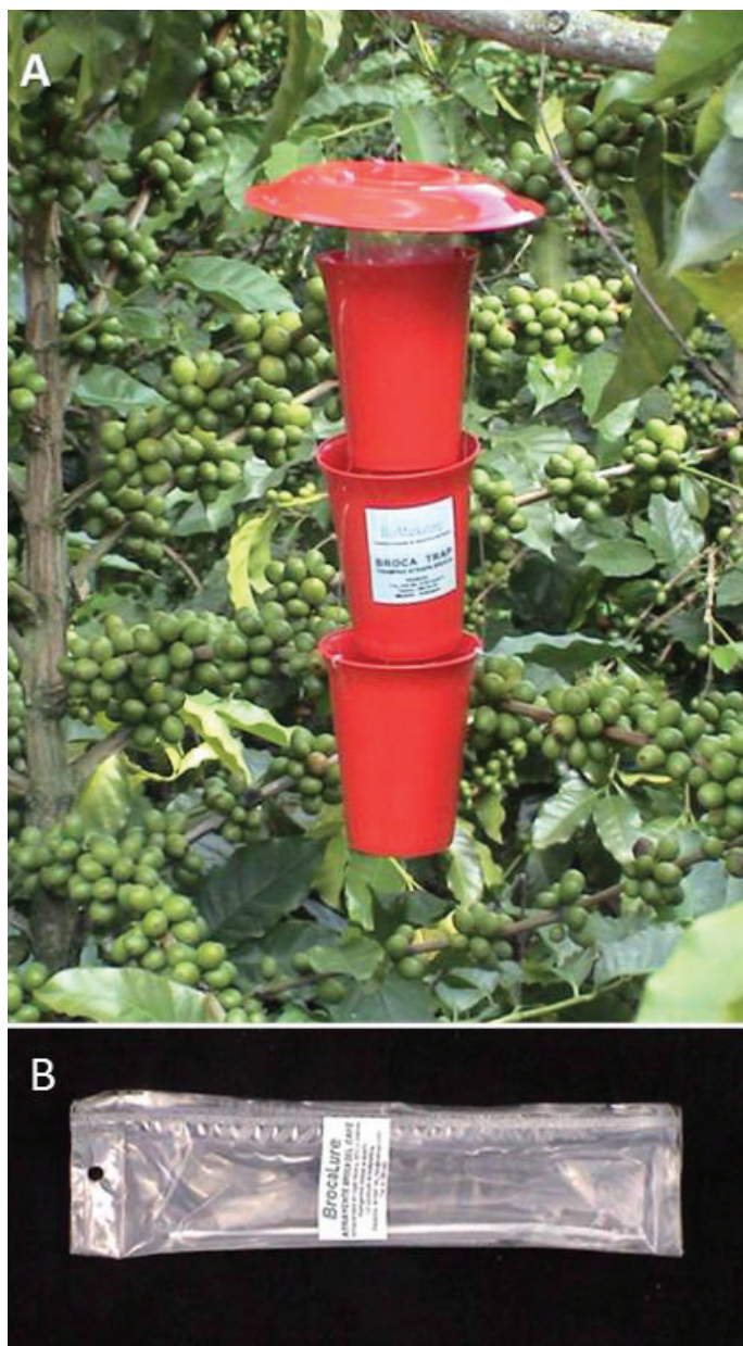
Fig. 1. A red funnel trap used to capture CBB ( Hypothenemus hampei ) (A) and the methanol-ethanol lure (3: 1 ratio) enclosed in a semi-permeable membrane (B). CBB were collected in a plastic container containing 200 mL of soapy water.

populations declined through the smaller harvest (Mar–Jun). Fewer CBB were collected in the small coffee farms (Viterbo) (averages of 38 to 105 CBB per trap/week), however, a similar seasonal trend was observed, with captures peaking from Jan–Mar (Fig. 2B). The start of the peak flight activity on smaller farms (Jan) again correlated with higher berry infestation (> 2.5%), and dropped later in the year as flight activity declined. A positive linear correlation (Pearson coefficient) between number of CBB captured and percent berry infestation was observed for both large ( r^2 = 0.90 ) and small ( r^2 = 0.68 ) farms. A similar relationship was reported by Pereira et al. (2012) in Brazil. However, their regression model could not determine an action threshold for CBB, since the intercept indicated that no CBB were caught at a low field infestation ( \approx 3 to 5% berry infestation), which was not observed in our study.