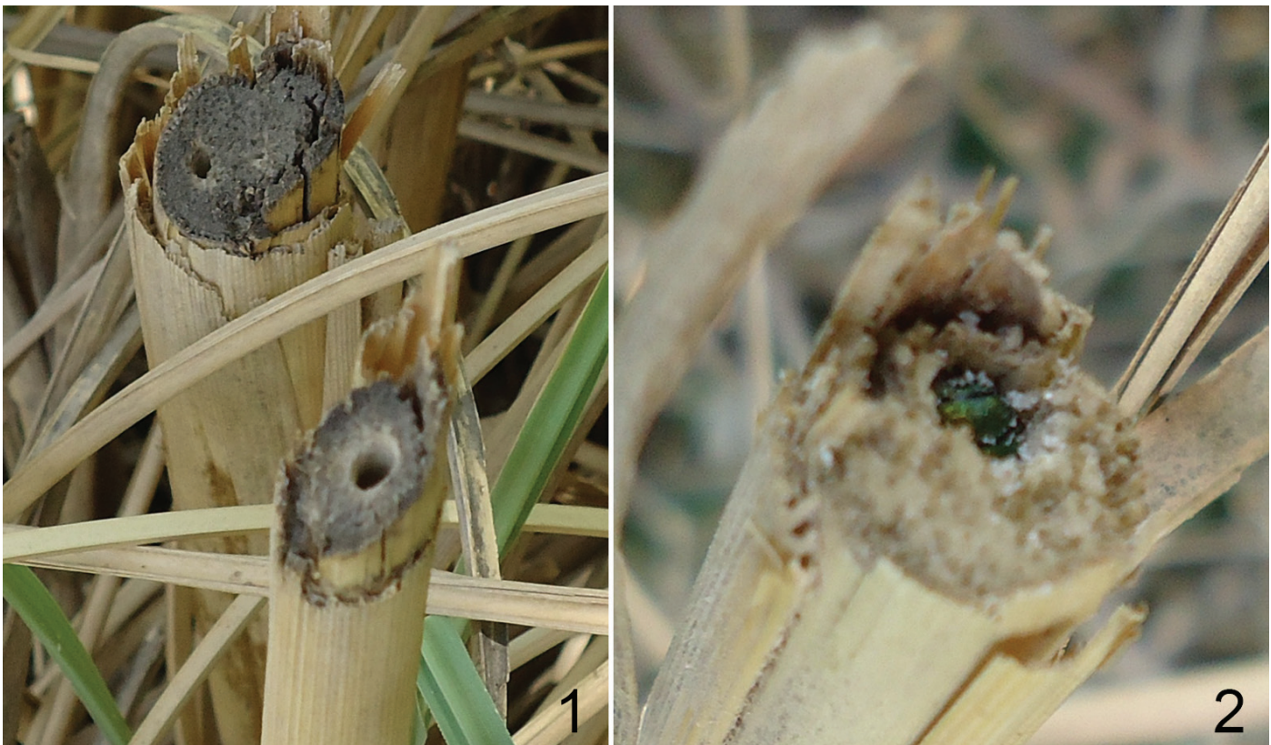
Figs. 1 and 2. Photographs of nest entrances of Ceratina ( Pithitis ) smaragdula in Ravenna grass stems ( Saccharum ravennae ) in northwestern Pakistan. 1. Two individual nest entrances. 2. Nest entrance with entrance blocked by the brilliant metallic green metasoma of a female guard.

Of the 20 nests that were destructively sampled, no failed nests (i.e., abandoned over the season, filled with fungus) were observed, nor were parasites ever observed associated with nests. Nest entrances were guarded by a female that blocked the opening with her metasomal tergum (Fig. 2). For the 20 nests sampled, the branches containing the nests had an average ( \pm SD) length of 16.22 \pm 7.15 cm and an average diameter of 1.00 \pm 0.28 cm. Nests had an average length of