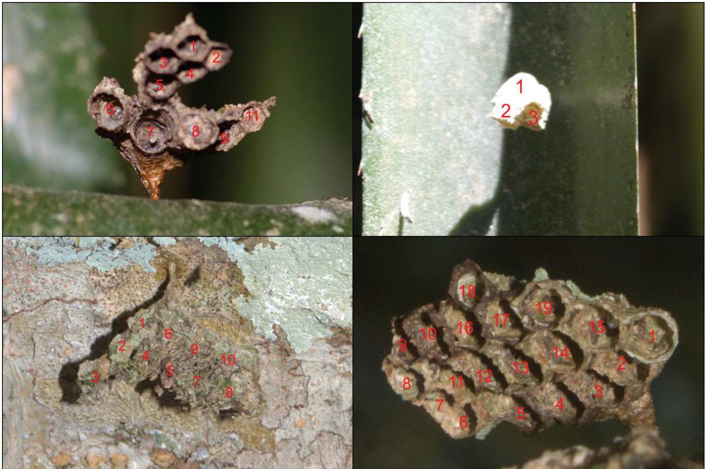
Fig. 1. Construction patterns of Mischocyttarus iheringi nests found in the Botanical Gardens of the Federal University of Juiz de Fora, Brazil, showing the number of cells.

iheringi , which leave the nest during a disturbance and do not exhibit stinging behavior similar to that displayed by most species of social wasps.