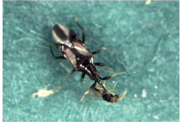
Fig. 3. Montandoniola confusa (Anthocoridae) attacking Thripistichus gentilei . This predator also feeds on the eggs and immature stages of Gynaikothrips species.