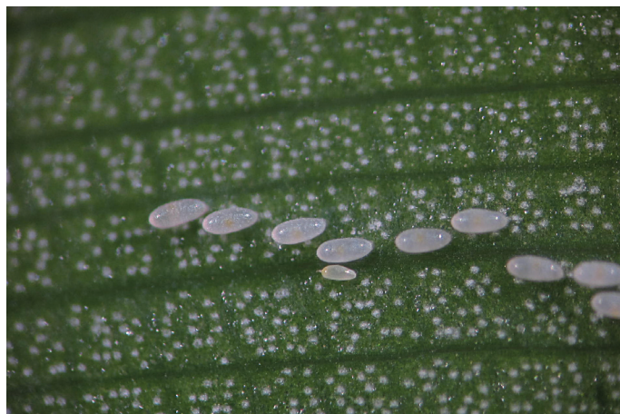
Fig. 2. Eggs of rugose spiraling whitefly (larger) and Bemisia tabaci (smaller) showing the difference in their size. The egg of B. tabaci was manually transferred from a collard leaf to a giant white bird of paradise leaf for taking this photo.

We estimated that N. oculata adults consumed a greater volume of rugose spiraling whitefly eggs per day in our study compared with the volume reported by Liu et al. (1997) for B. tabaci eggs at comparable temperatures. However, the beetles in our study had a slower egg-to-adult development (21.3 d compared with 18.8 d). The effect of prey type on biological parameters of predatory Coccinellidae has been studied by various authors (Omkar & Srivastava 2003; Zhang et al. 2007). For example, Omkar & Srivastava (2003) found that Coccinella septempunctata L. develops fastest on Lipaphis erysimi (Kaltenbach) and slowest on Aphis nerii Boyer de Fonscolombe among 6 aphid species (Hemiptera: Aphididae) used in the study. Similarly, the host