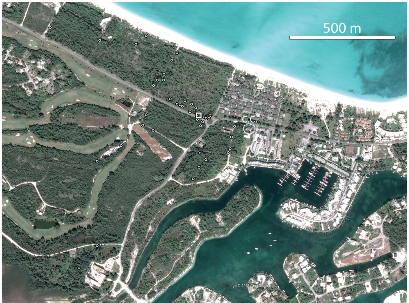
Fig. 2. Treasure Cay area, Abaco Island, The Bahamas infested by Nasutitermes corniger . Original 2005 N. corniger locality (white square), September 2015 live collection sites (black and white dots), and Treasure Cay Community Centre (C.C.). Imagery date: 31 Oct 2014, Google Earth®.

As with the Dania Beach, Florida, infestation (Scheffrahn et al. 2014), the mode and date of establishment of N. corniger on Treasure Cay, Abaco, cannot be determined. However, establishment by a dis-