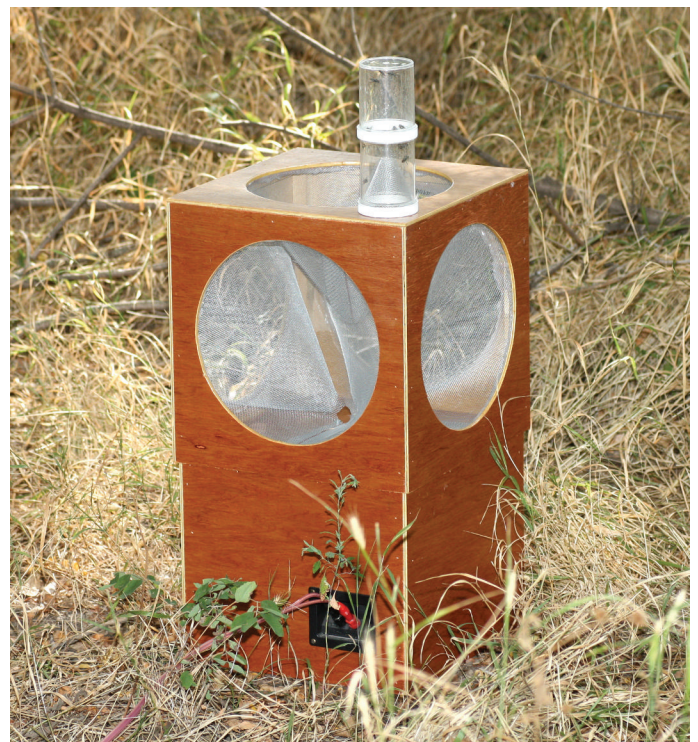
Fig. 1. The complete live trap deployed in the field. Captured flies are visible in the holding jar assembly at the top of the trap box.

The trap consists of two main components (Figs. 1 and 2). First, the "speaker box" is a simple wooden box with an upward-facing loudspeaker mounted in the middle of the top face and a piece of aluminum window screen covering the aperture of the speaker to pre-