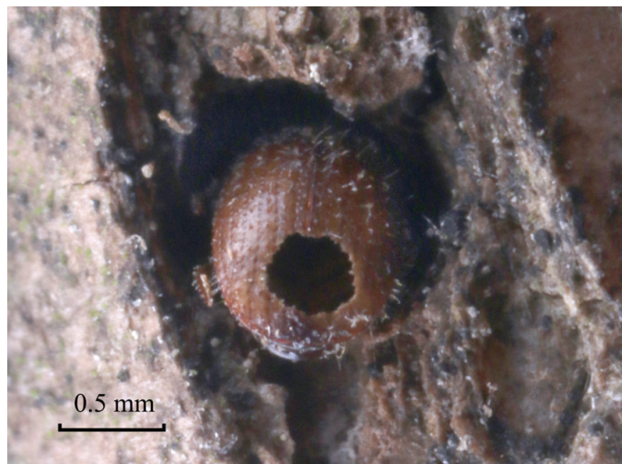
Fig. 2. The elytral declivity of Euwallacea fornicatus after being parasitized by an unknown natural enemy.

Euwallacea fornicatus (Eichhoff) (Coleoptera: Curculionidae) is an emerging invasive tree pest, but its native distribution remains incompletely known because minimal records have been published from