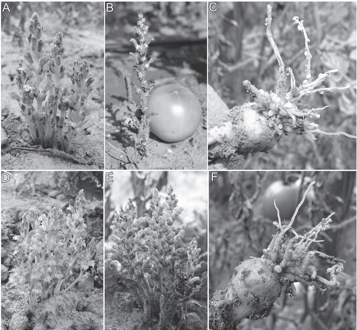
Fig. 1. General habit of the holoparasitic broomrape Phelipanche ramosa : noninfected plant (A, D), plant weakened by aphids infection (B, E), Smynturodes betae feeding haustoria of broomrape (also visible are Lasius sp. ants) (C, F).