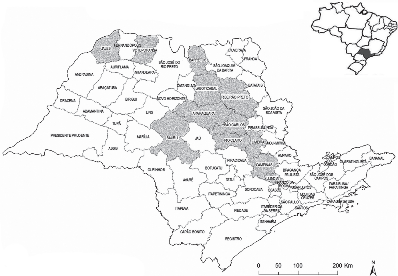
Fig. 1. Map of the state of São Paulo (Brazil), indicating micro-regions where collections were conducted.

Another explanation for variation in the scale insect fauna associated with citrus in different regions may be related to misidentifications, mainly due to the remarkable macro- and microscopic similarities between some of these species. For example, Planococcus citri , which is known to infest citrus plants in São Paulo, and P. minor (Maskell), which has been reported in the states of Amazonas, Espírito Santo, and Paraíba, mainly on coffee, cotton, and cassava (García Morales et al. 2016), are closely related, cryptic species. In Brazil, although P. minor has not been recorded on Citrus spp., it has been recorded on plants in this genus in other regions of the world (García Morales et al. 2016). Thus, information related to the occurrence of P. citri should be reviewed at the molecular level. Also, many P. praelonga infestations of citrus orchards in the state of Pernambuco initially were misidentified as Insignorthezia insignis (Browne) (Kogan 1964). These species can be separated in life mainly by the length and shape of the ovisac, which is longer and with parallel edges in P. praelonga , and shorter and with the posterior margin slightly convergent in I. insignis . However, a more obvious difference is that the dorsum in I. insignis is predominantly dark green, whereas in P. praelonga it is mostly covered by white wax plates (Kondo et al. 2012).