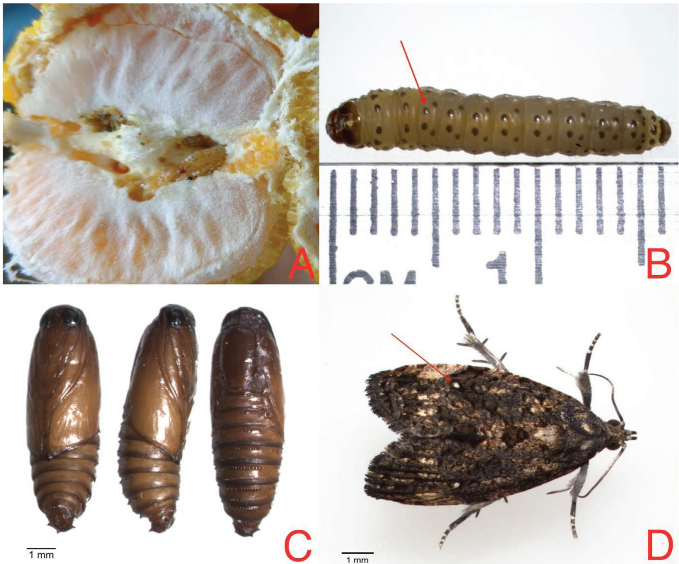
Fig. 1. (A) Gymnandrosoma aurantianum larvae infesting mandarin ( Citrus reticulata ) fruit; (B) Larva at fifth instar; (C) Pupae (ventral, lateral, and dorsal views); (D) Adult of Gymnandrosoma aurantianum .