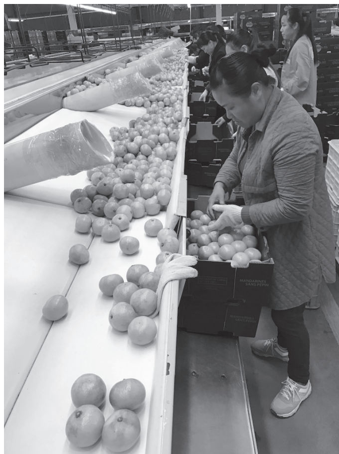
Fig. 3. Final packinghouse culling.

This reported work is just a beginning attempt to explore a systems approach for risk mitigation of fruit flies for citrus exports from China. A systems approach requires the use of 2 or more independent measures to achieve the goal of mitigation (FAO 2012). However, the 2 measures studied here, i.e., packinghouse culling and field fruit bagging, were effective for 2 different commodities, and under different production systems. To develop a systems approach for each of the commodities, more quantitative information regarding the efficacies of other risk mitigation measures along the pathway are needed. For Satsuma mandarins or other mandarin fruits, for example, what are the field practices that constitute a good pest management program? And what is the efficacy of this program, as well as the efficacies of other measures before the packinghouse in reducing the risk? For pomelos, what is the efficacy of shrink-wrapping for risk mitigation of fruit flies? Shrink-wrapping has been demonstrated as an effective measure for risk mitigation of fruit flies in other fresh fruits (Gould & Sharp 1990). Almost all pomelo fruits were shrink-wrapped in packinghouses in China. A combination of this packinghouse measure with the pre-harvest measure of fruit bagging can be a practical and economical systems approach for the pomelo trade.