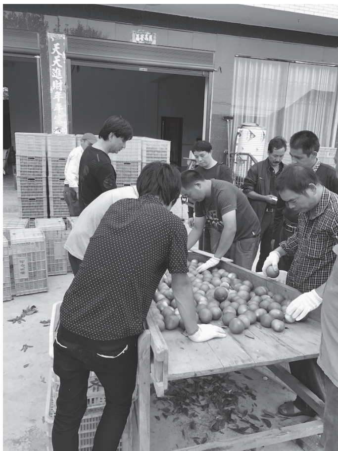
Fig. 2. Culling at local purchase station.