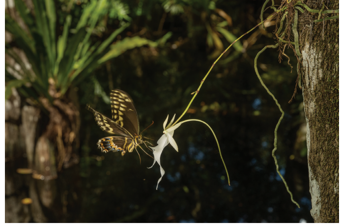
Fig. 10. Palamedes swallowtail butterfly ( Papilio palamedes ) visiting Dendrophylax lindenii flower during daylight hours (9 Aug 2017, 10:59 AM Eastern Standard Time).