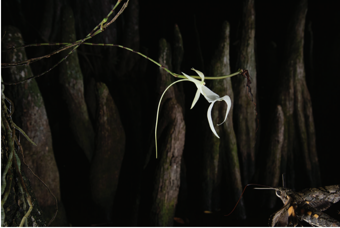
Fig. 7. Cocytius antaeus flying towards Dendrophylax lindenii flower (29 Jul 2018, 8:37 PM Eastern Standard Time).