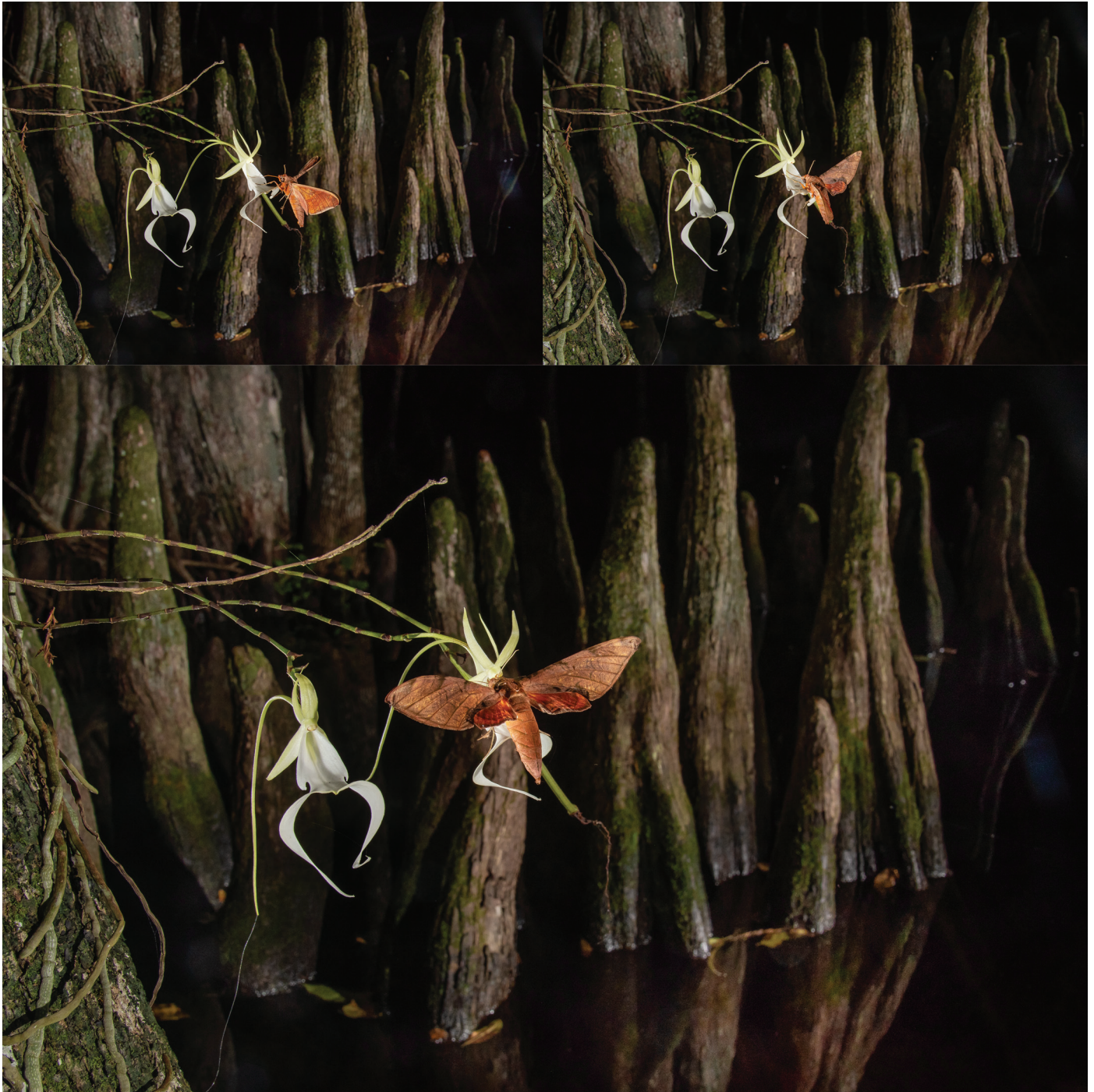
Fig. 6. Photo sequence of Protambulyx strigilis nectaring on Dendrophylax lindenii flower, with proboscis fully inserted into the nectar spur in the bottom image (17 Aug 2018, 10:07 PM Eastern Standard Time).

emphasis on the specialized needs of orchids (e.g., pollinators, mycorrhizal fungi); (2) establishment of ex situ seed and mycorrhiza banks for orchids under immediate threat; and (3) development of orchid restoration techniques. For D. lindenii , all 3 of these actions have been achieved largely due to coordinated research efforts in southern Florida and Cuba during the past decade (see Hoang et al. 2016; Mujica et al. 2018; Zettler et al. 2019; Coopman & Kane 2019). Collectively, all of these efforts have aligned in favor of D. lindenii with 1 important exception – virtually no information existed on the pollination biology of the ghost orchid until now. In addition to the aforementioned actions,