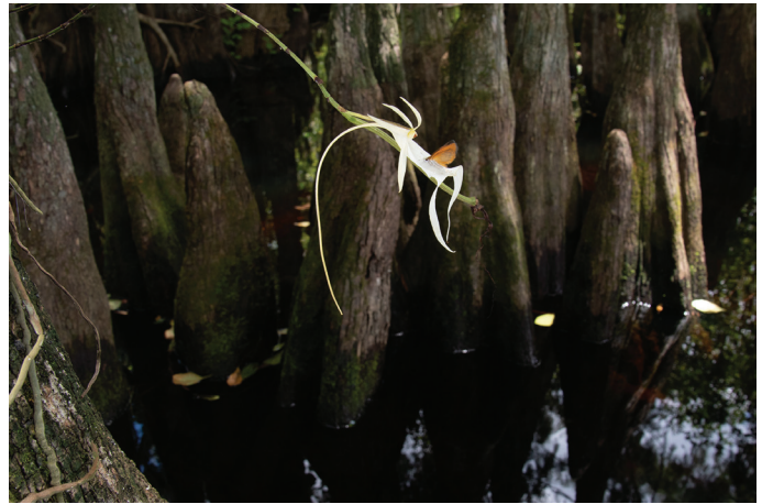
Fig. 11. Unidentified Geometrid moth resting on the labellum of Dendrophylax lindenii flower. The head of the insect is positioned over the concave labellum's upper surface where moisture droplets from dew and rain have been known to accumulate (6 Aug 2018, 2:02 PM Eastern Standard Time).