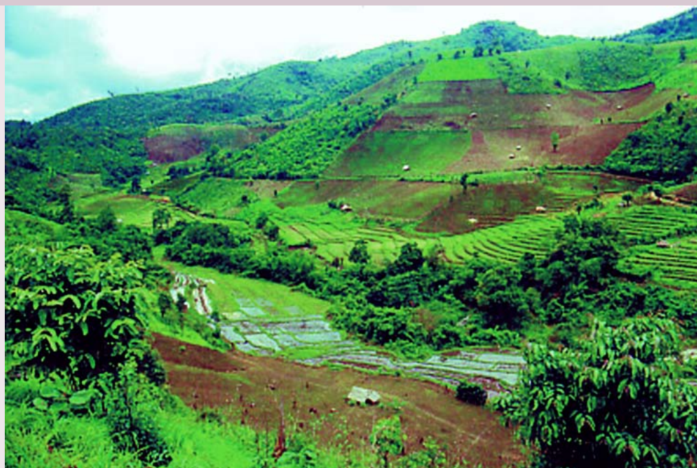
FIGURE 1 A mosaic of mountain land uses: vicinity of Mae Cham village, Chiang Mai, Thailand.

achieved with the help of cropping systems developed and adapted by farmers themselves (Figure 1). Studying farmers' management techniques will allow this success to be repeated elsewhere, but only if it is based on the idea of dynamic variation in cropping system management that occurs within and between mountain agroecosystems, defined as agrodiversity.