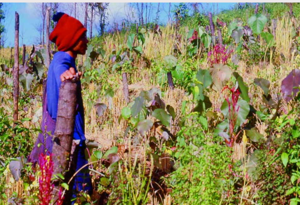
FIGURE 3 Upland rice field after harvest, with pada .

Mae Rid Pagae is a Skaw Karen village in Mae Hong Son, near Myanmar. In the past, the village subsisted on rotational shifting cultivation supplemented by limited irrigated wetland rice and off-farm employment in the nearby town of Mae Sariang in bad years. The introduction of cabbage in the early 1980s raised productivity significantly. The success of Mae Rid Pagae, however, is not a matter of just growing cabbage; new cropping systems have evolved, incorporating cabbage production and components of traditional cropping systems. Cabbage is grown in paddies with irrigation in the dry season,