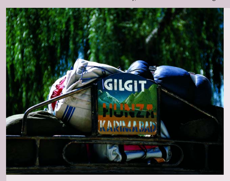
FIGURE 1 International tourists who visit the north of Pakistan no longer use local buses such as this one.

ment, and ecotourism are closely linked. Tourism activities in Pakistan are currently far from sustainable, as in many other mountain regions worldwide: deforestation, uncontrolled land utilization, unplanned growth of tourism, mushrooming growth of accommodations, and, above all, outmigration of young, energetic people as a result of limited job opportunities and lack of local ownership and participation in tourism ventures make change imperative. This paper recommends strategies and measures that urgently need to be developed at all levels.