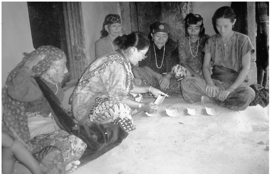
FIGURE 4 A participatory exercise in the study area.

men in Silichong. A workshop was conducted so that the team could define common research objectives, followed by training in concepts and methods of Participatory Rural Appraisal (PRA) and gender analysis. The objective of the research was to gather information on existing crops and varieties cultivated in Tamku VDC, with a particular emphasis on the role of women and men in the management of crops and other livelihood strategies. This initial research was conducted over a period of 3 months, and the results, particularly those factors that contribute to low productivity in crop yields, formed the basis for the next stage in the assessment.