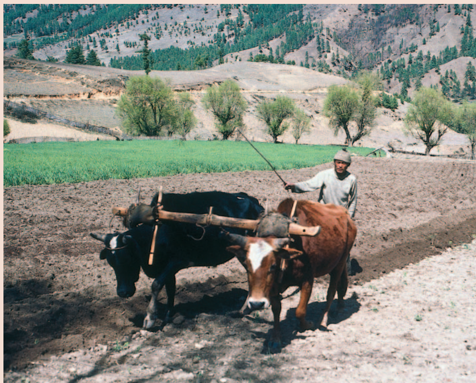
FIGURE 2 Using bullocks for planting potatoes.

Potato growers use either tractors or draft bullocks for tillage work while all other cultural practices are carried out manually. Potato cultivation is thus relatively labor intensive, requiring repeated weeding and earthing-up operations. As increased labor costs reduce potential profits, animal power for mechanized planting, weeding and earthing up was introduced in the late 1970s. Simple equipment from Switzerland was first introduced in 1975. Initial attempts to introduce such equipment with horses failed because farmers were not familiar with horses as draft animals, and the equipment produced in Bhutan was too expensive. Subsequently, farmer-driven