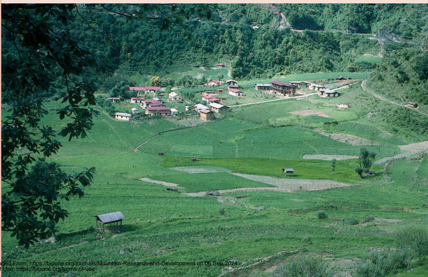
FIGURE 1 Potato field in Khaling (Trashigang district). Ten years after the village became accessible by road, almost every household had adopted potato production for export.

during the 18 th and 19 th centuries, they never became a staple food. By the middle of the 19 th century, many farmers had abandoned potato cultivation because of the poor yields caused by wart disease. The main impetus for current potato cultivation came from road construction in the early 1960s, which made temperate