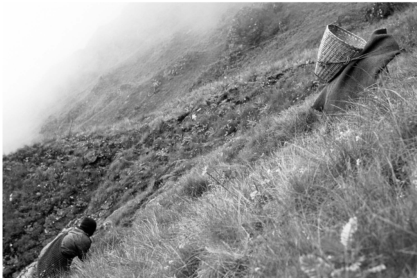
FIGURE 1 Collectors of alpine medicinal and aromatic plants (MAPs) in Gorkha District.

tral development regions of Nepal, and from individuals at the national and international levels in Kathmandu (Figure 2). Overall, 5 categories of stakeholders were identified on the basis of previous studies (Olsen and Helles 1997; Larsen et al 2000):