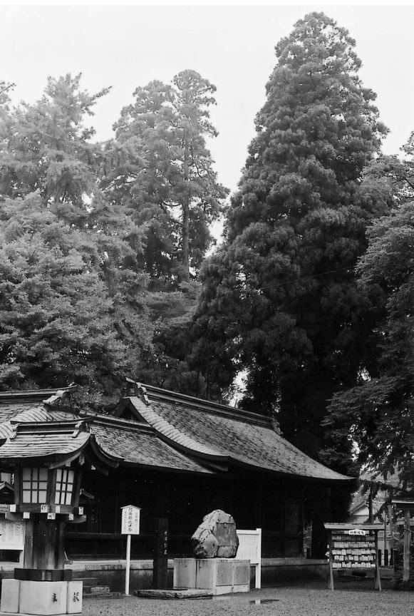
FIGURE 1 Ogatamanoki, Michelia compressa Sarg., at Aso-jingu shrine in Kumamoto prefecture, Japan.

ral environment, they should be protected and conserved as a heritage for citizens.