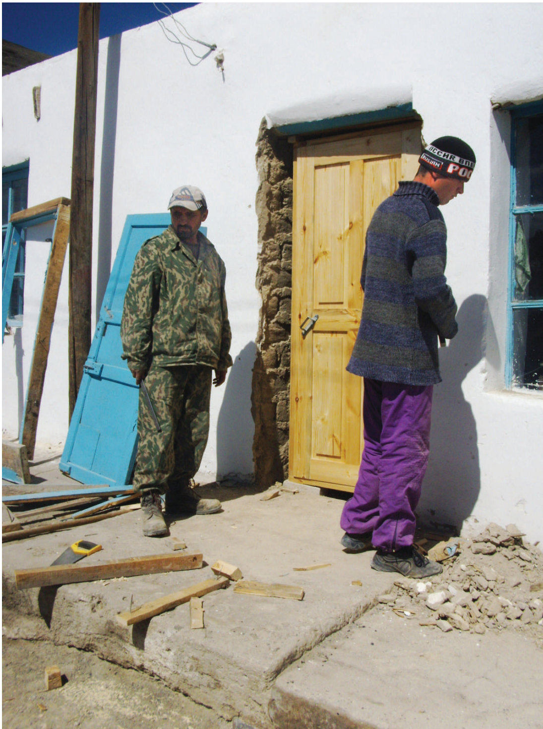
FIGURE 3 Construction workers in Murgab are installing a hermetically closing wooden door produced by carpenters in Khorog.