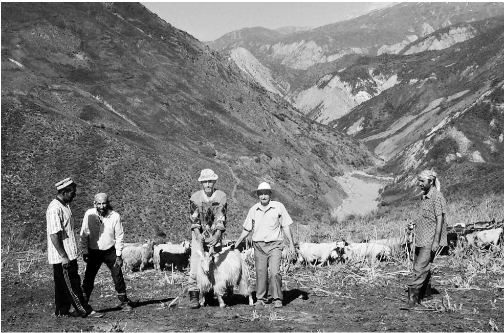
FIGURE 1 Hired shepherds in summer pastures, Surkhob valley, Tajikistan.

worsened this winter feed scarcity (Fitzherbert 2000). The inefficient processing and storage of hay also aggravates the winter feed scarcity (Figure 2), with estimates that this leads to a loss of energy and nutrients of up to 40% (World Bank 2007).