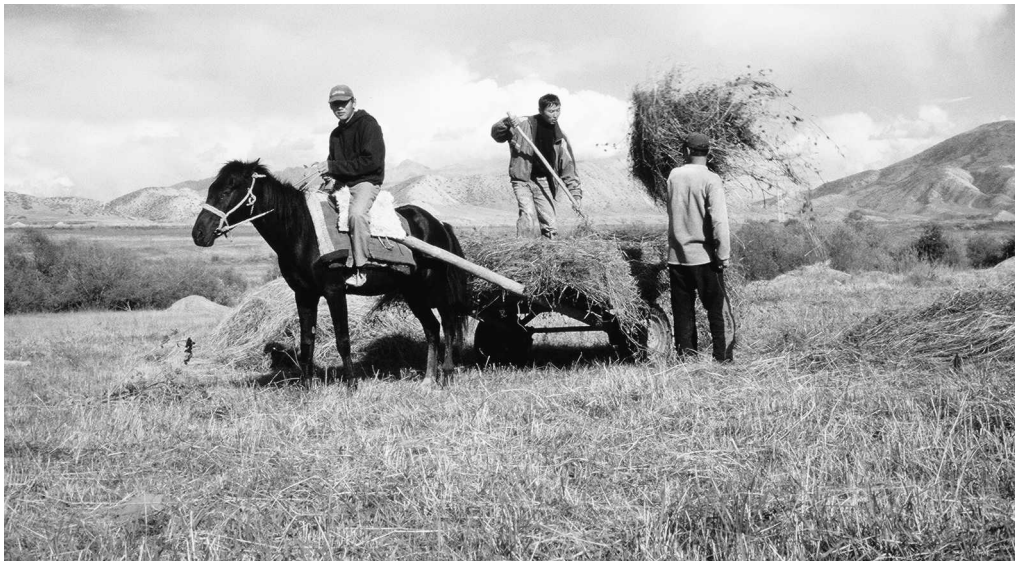
FIGURE 2 Hay harvesting, Naryn, Kyrgyzstan.

through overgrazing. However, no field research has been conducted in this region to test the impacts on pastureland of the rising goat numbers versus sheep and cattle.