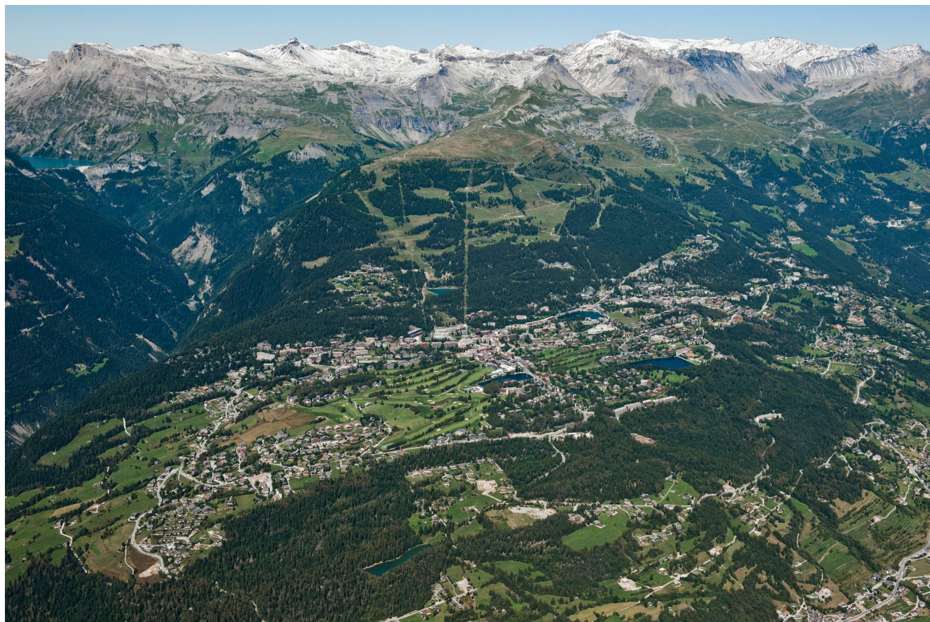
FIGURE 1 Part of the Crans-Montana-Sierre region. In the middle is the tourism resort of Crans-Montana, with several reservoirs, golf and skiing areas in the background, the Tseuzier reservoir is at the top left, and agricultural and settlement areas at the lower right.

agreements that have not been formalized, for example, through a written contract; this includes customary law. Sometimes, these agreements are so deeply rooted among the actors involved that they become a tacit understanding.