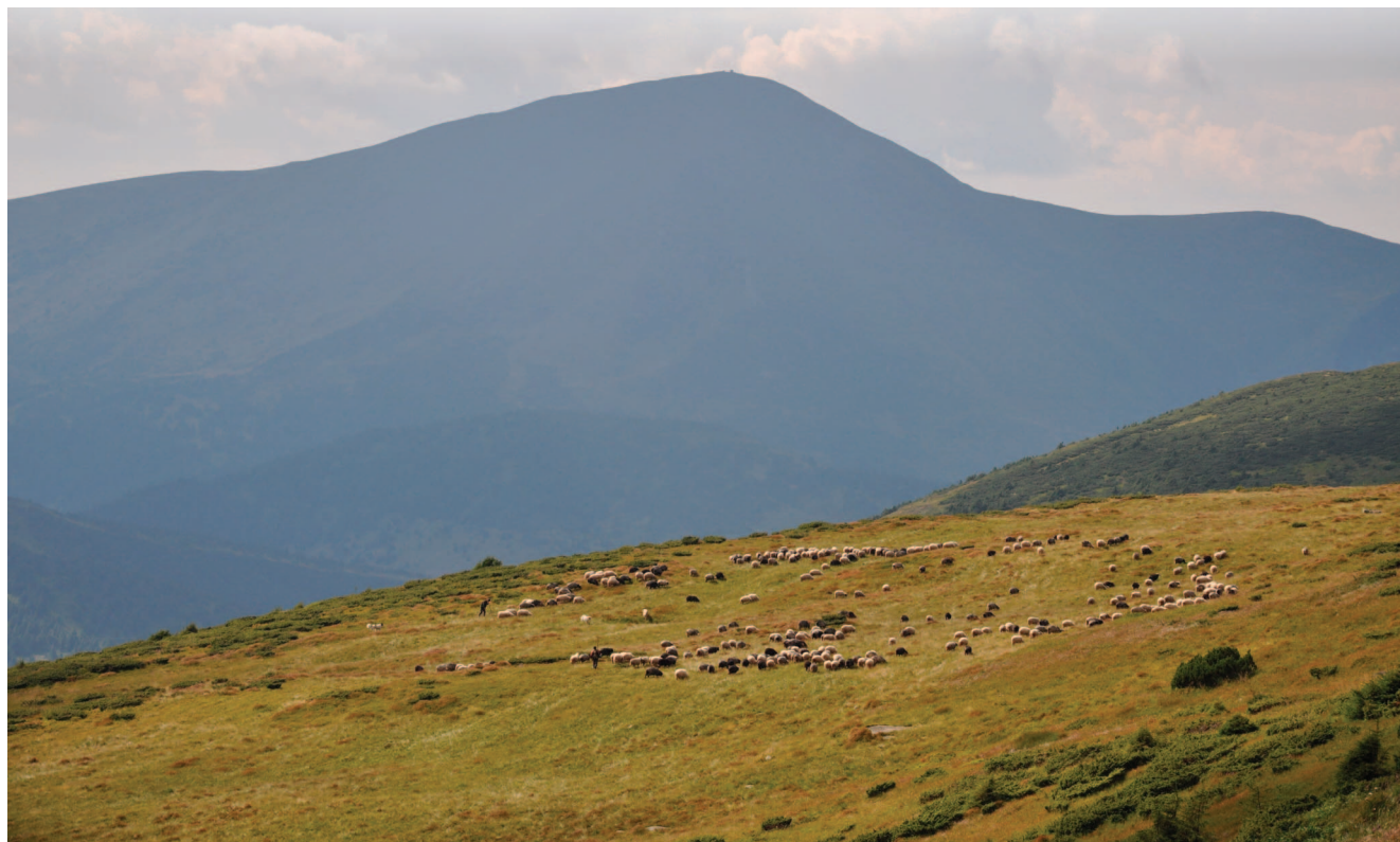
FIGURE 4 Sheep grazing on a subalpine polonyna in the western Chornohora in the CBR buffer zone.