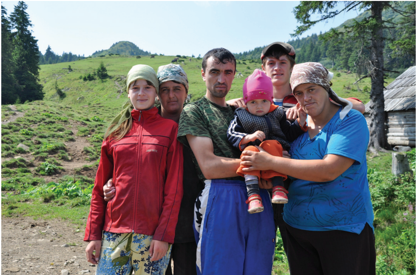
FIGURE 2 Hutsul family that used to work each summer on a cattle farm below Mt Petros in the western Chornohora, just outside the CBR.

land ownership. These differences, in our opinion, have been recently reinforced by a shift in land management policy: 1-year leases for mountain pastures are being replaced by 49-year leases. This has already been implemented in the Ivano-Frankivsk region. Adding a further degree of complexity to land management patterns in the region, some of the farms operate within 1 of 2 large protected areas: the Carpathian National Nature Park (CNNP) and the Carpathian Biosphere Reserve (CBR).