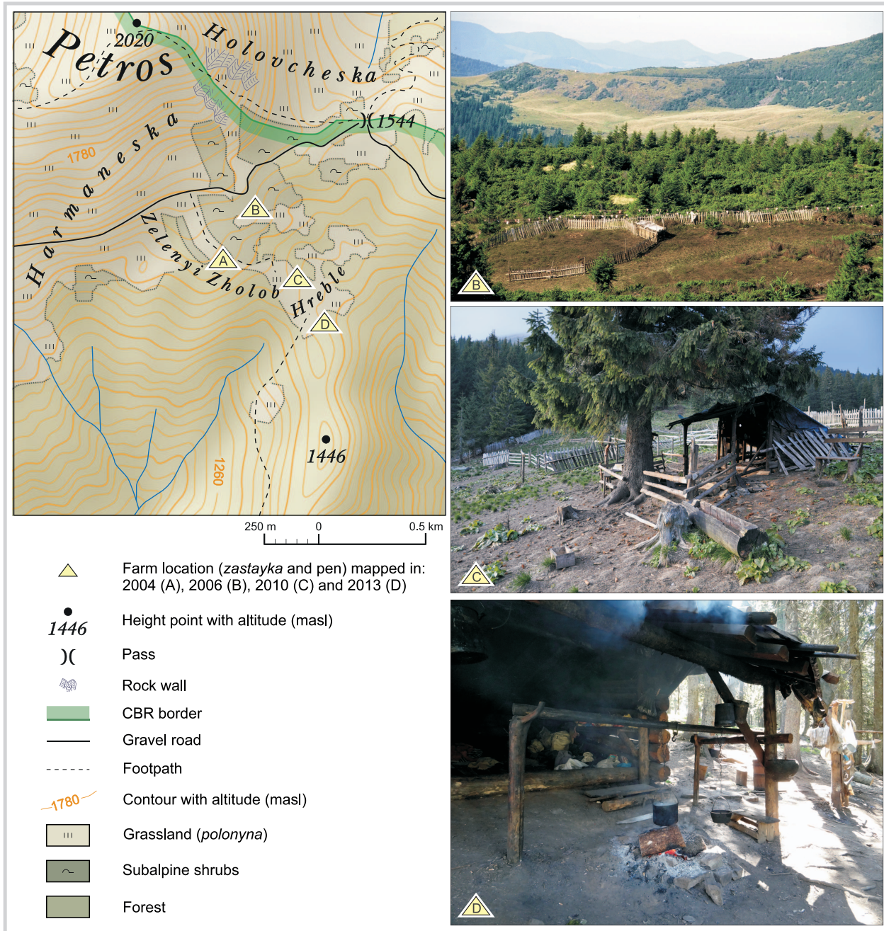
FIGURE 3 Zelenyi Zholob (Hreble) sheep farm in the CBR zone of anthropogenic landscapes—location changes 2004–2013. (Map by Mateusz Troll based on Krugar and Troll 2013)

today only secondary meadows situated in the forest zone are used (Figure 5).