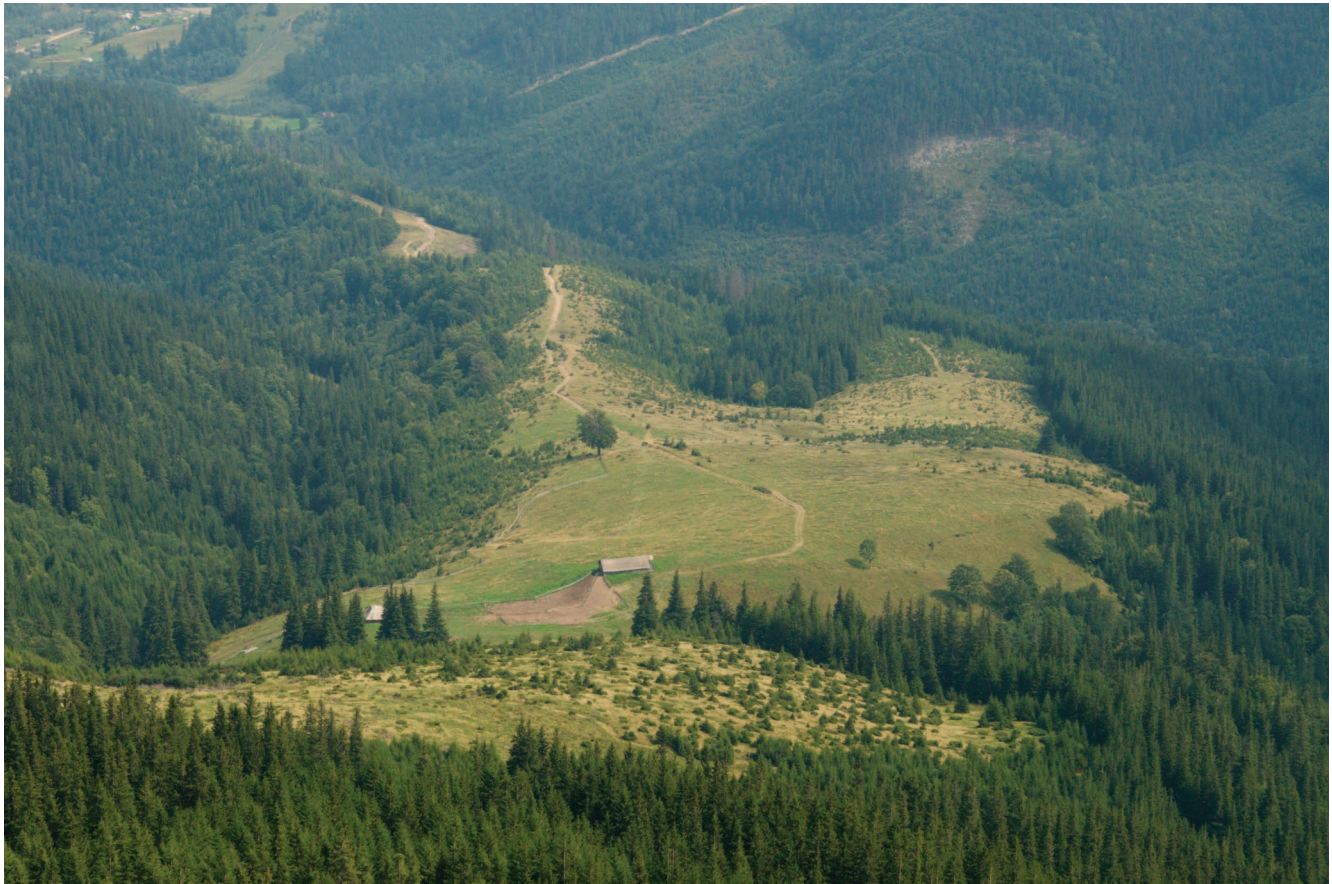
FIGURE 5 Smotrych cattle farm with buildings from the collective-farm era situated on a secondary pasture that is gradually reverting to woody vegetation in the CNNP zone of economic activity.

specialization was due to the better accessibility of the former property, which is important for transport of milk and dairy products to villages. Ivan used to hire people from the remote village of Babyn (around 70 km from the farm), who were known as exceptional herders. This village has traditional connections with pastures in the area that predate World War II.