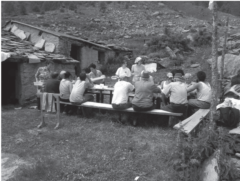
FIGURE 2 Extended pastoral family having lunch with helping friends and neighbors after ascending to the summer pastures in Bobbio Pellice municipality, July 2013.

Small as it is, the sample of 15 families that was the focus of the in-depth study conducted in the Pellice Valley, and especially in the 2 municipalities of Bobbio (44°48'00"N 7°07'00"E, 732 m) and Villar (44°48'00"N 7°10'00"E, 664 m), is quite revealing in this sense. If we first look at families as sets of kin by blood or marriage (or cohabitational relationship) who live together under the same roof, we discover that these 15 households, accounting for over 80% of the families engaged in pastoralism in the valley, have a mean size of 3.87 members, significantly larger than the estimates of 1.83 and 2.02 members for Bobbio and Villar, respectively (ISTAT 2012), and that they range in size from 2 to 7, very much in accordance with the number and kinds of animals they breed. No less than 7 out of 15 pastoral households are not nuclear in structure; 6 of the 7 are 3- or 4-generational. One household consists of a married couple in their 50s, their 2 adult daughters and the elderly parents of both husband and wife; another highly complex domestic group includes a married man and his wife, the wife's mother, the couple's adult son, a daughter and her partner, and a grandson. In 2 small households, young adult men live with their grandparents. Both size and structure set pastoral households apart from most other households in the Pellice Valley.