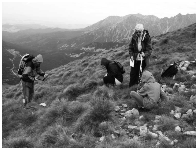
FIGURE 2 The first 2 authors of the present article conducting field measurements in the Gąsienicowa Valley.