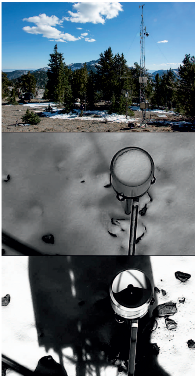
FIGURE 3 Using a webcam as part of an environmental sensor deployment (top) allows the operator to capture images that assist data quality control. In this case, hourly images can show if precipitation is in solid form (middle), which is not usually captured properly by instruments such as a liquid tipping bucket gauge (bottom).