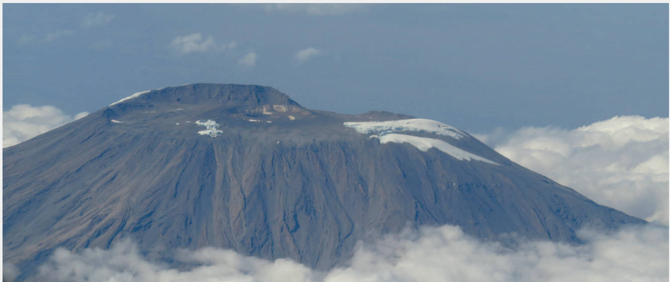
FIGURE 3 About 85% of the glacial ice on Mount Kilimanjaro disappeared between 1912 and 2011. Estimates vary, but several scientists predict it will be gone by 2060 (Earth Observatory, 2012). Such knowledge is key to informing SMD policies.

As knowledge is key to informed decisions (Figure 3), ARCOS developed an online platform, the ARCOS Biodiversity Information Management System ( http://arbims.arcosnetwork.org/ ), to facilitate information sharing on issues pertaining to SMD. In the same framework, stakeholders also joined hands to enhance knowledge of Africa's mountains by collecting and packaging information. Those include, among others, ARCOS's