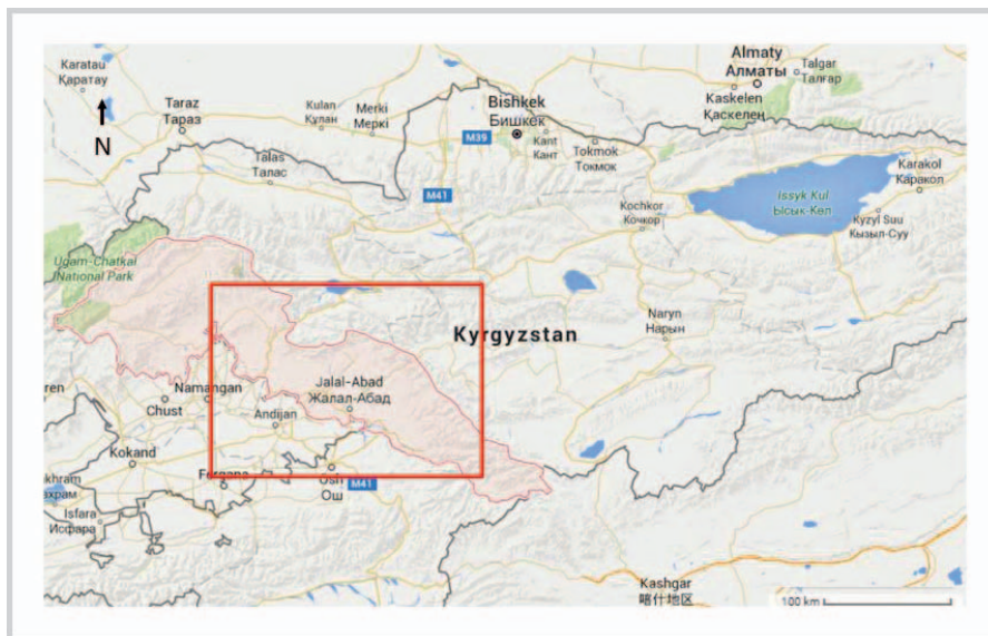
FIGURE 1 Location of the walnut forest region in southwestern Kyrgyzstan (dashed red). (Map: extract from Google Maps)

mm; but annual precipitation decreases with lower elevation. Average January and July air temperatures are -3.1^{\circ}\text{C} and 20.5^{\circ}\text{C} , respectively. During frost periods, air temperature falls to -20^{\circ}\text{C} (Venglovskiy et al 2010). At the lower forest boundary (900 m), annual precipitation is only 535 mm so that forest stands are distributed only on northern exposed slopes. Precipitation peaks in spring and autumn with about half of the annual precipitation falling in the months of March, April, May, and October. August and September are the driest months.