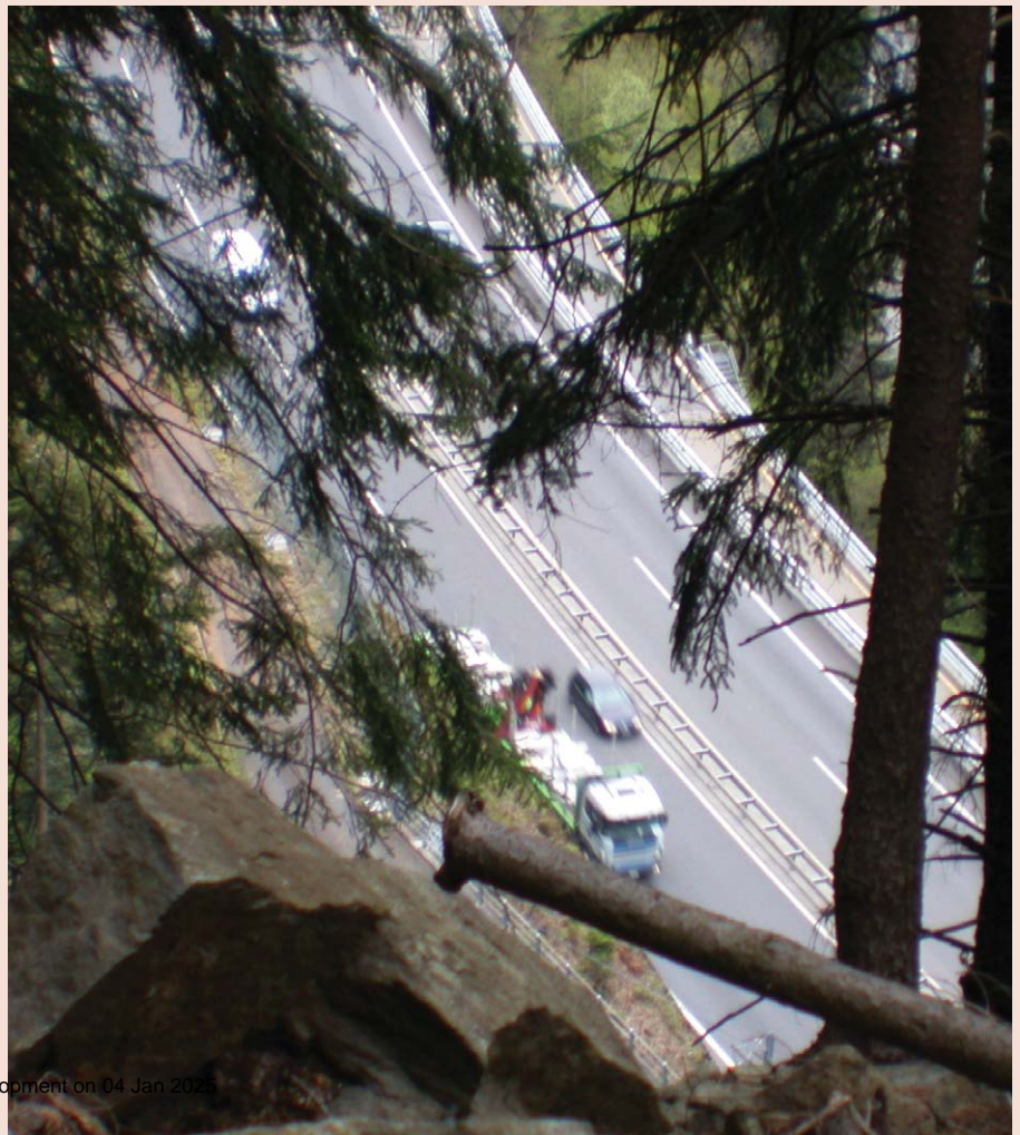
FIGURE 1 Rockfall threatens trans-Alpine transportation infrastructure.

not produced satisfactory results. It has been recognized that sectoral interventions cannot solve the forest vs game animal problem; uncertainty and disagreement continue to prevail about how to continue dealing with this problem. Faced with this challenge, representatives of a large number of regional and trans-regional interest groups started to meet. Amongst the most important in the Stotzigwald “action system” were landown-