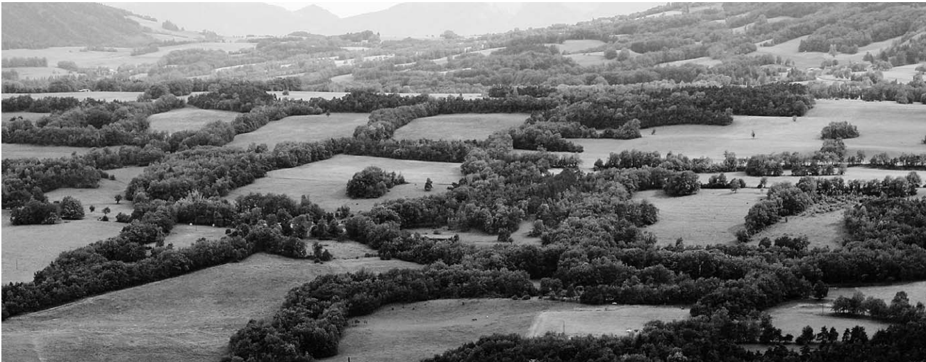
FIGURE 2 A well-structured landscape offers a habitat for a variety of species.

outset of the local and regional planning process (municipalities, regional authorities).