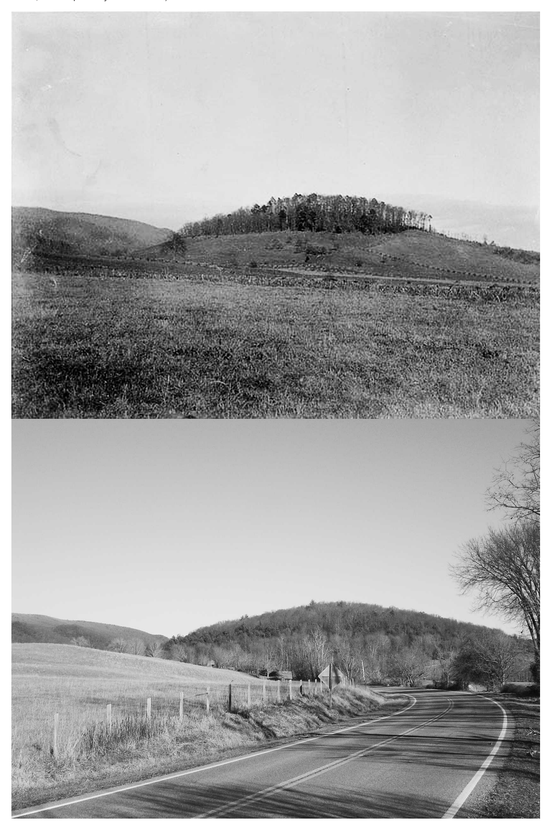
FIGURE 1 Repeat photographs from Walker's Creek near White Gate, Virginia. The top photograph was taken in 1880 and the bottom photograph in 2008. The hill in the background represents the conversion of higher elevation agricultural lands to forest.