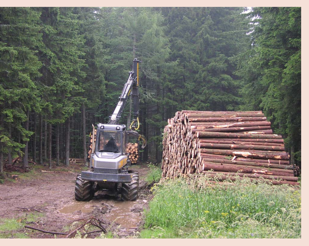
FIGURE 4 In the western part of the Ore Mountains, most of the forest still has a high economic importance.

ing Norway spruce are based on very heavy thinning at a top height of 5–7 m. Damaged trees should be preferentially removed by negative selection. At the same time, admixture of shade-tolerant broadleaved species is proposed. Heavy thinning increases stability with respect to snow, hard rime, and wind damage; it also stimulates radial increment, decreases the deposition load, and results in better litter decomposition. For larch, positive selection thinning is recommended in stands of high quality, to avoid excessive breakage of the canopy; in stands of lower quality, negative selection is appropriate. The environmental functions of larch stands are to be supported, including underplanting with beech in enclosed areas of the stands. For beech a first thinning is recommended in stands with a height of 4 m, followed by 6 interventions in quality stands, and 4 in lower quality stands. The first thinning should focus on negative selection; later, positive selection of dominant trees should be performed.