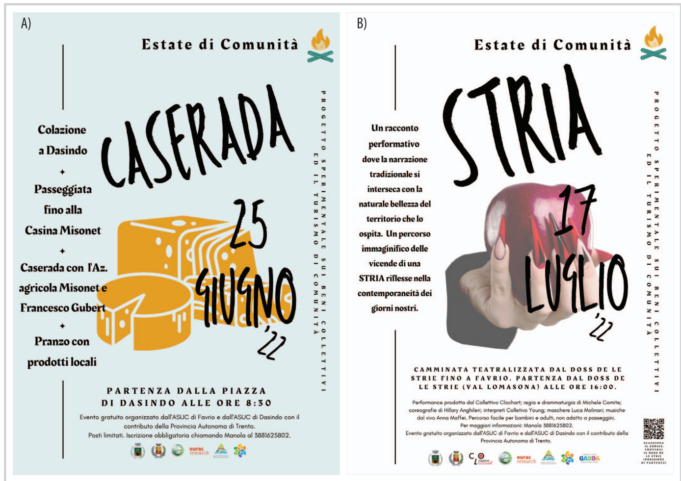
FIGURE 6 The first outputs of knowledge cocreation and intervention: advertising materials for the revitalization of collective resources through community-based tourism. (A) A poster advertising a collective cheese-making activity and lunch at the community hut. (B) A poster promoting a walking theater performance created by a theater collective with the participation of local communities and held in a space that symbolizes collective identity.

engagement of inhabitants toward care for the collective goods. Some conflicts (I4) were identified in the interviews. These relate to increasing land fragmentation and different interests within the community (eg clearing rewilded spaces versus keeping specific tree species), and to different models of agricultural production (eg intensive and industrial versus extensive and based on short value chains). The intervention assessed in this study represents a step in reconfiguring the organizational model in terms of opening the decision-making process to increase awareness and empowerment of the communities toward collective resource care. The intervention created the conditions for the elected delegates to have a discussion with community members and external local stakeholders about the future of the commons and its contribution to local sustainable development.