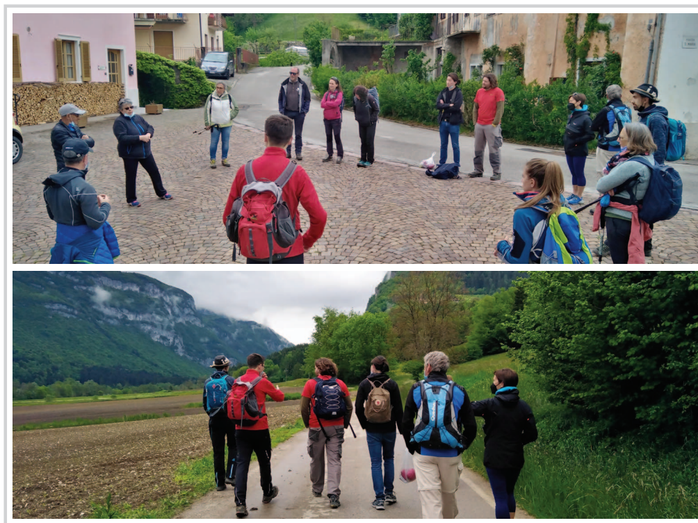
FIGURE 4 During the festival, convivial moments with the community and walks were functional to build relations with the communities and to explore collective resources and issues at stake.

Here, we briefly present the outputs of the different intervention phases and activities. The focus groups and surveys in each community were centered on identifying a variety of resources considered to be important for the community to take care of collectively; assessing how the values of these resources are changing; and envisioning their future and revitalization in the perspective of community development. Each focus group was carried out by dividing the participants into groups, each moderated by a core team member taking notes on a flipchart. Focus was placed on creating a group discussion to identify as many different resource values as possible, and to create a platform for communication among participants and discovery of these values and different interests. The reported resources and visions were interpreted according to the SESF categories (see Table S1, Supplemental material , https://doi.org/10.1659/mrd.2022.00013.1.S1 ). The resources identified in the focus