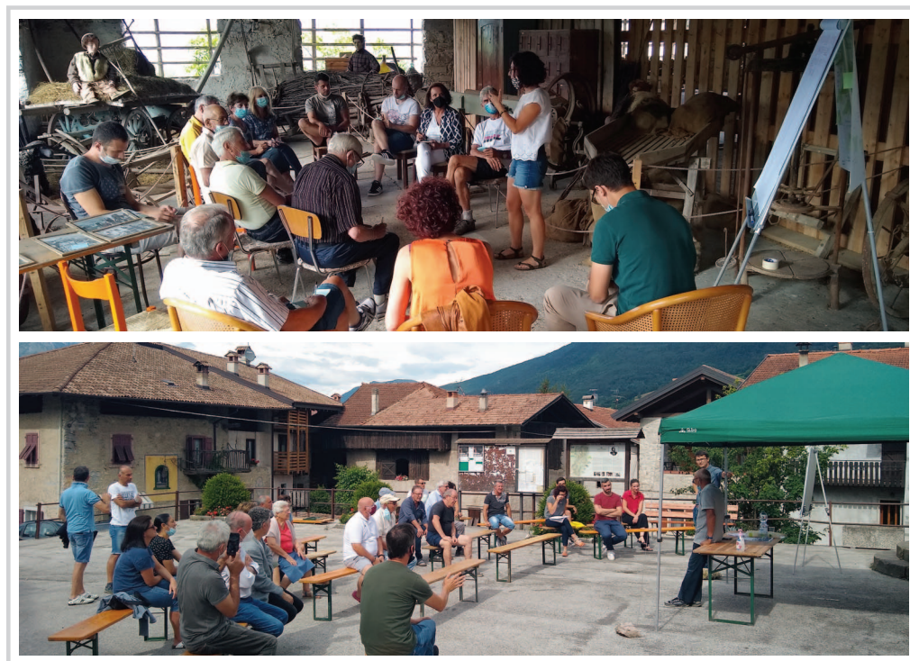
FIGURE 2 Intervention and research activities included focus group interviews in each community to identify collective resources, their changing values, and their future.

Note: CM, community members; ES, external local stakeholders.