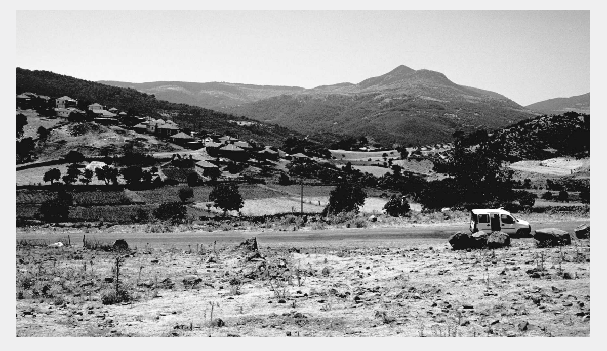
FIGURE 2 Pilot project site in the Yuntdagi Mountains, Turkey.

institutional framework, the strengthening of institutional capacity to facilitate regional collaboration, the assessment of the status of natural resources in FDH, and the development of replicable, community-based sustainable land management models. This GEF project started in early 2009, is laid out for a duration of 10 years, and involves 8 countries from both Anglophone and Francophone West Africa.