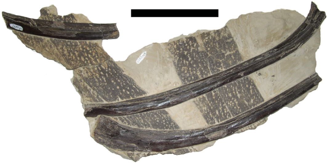
Figure 3. Fragments of sternal cartilage and ribs of VP-2297. Note the distinctive pitted appearance of the cartilage. Scale bar = 10 cm.