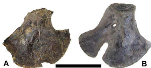
Figure 2. A. Left coracoid of VP-2297 in lateral view, anterior to the left. The estimated length of the mosasaur is 6.7 m. B. Left coracoid of a 5.8 m Platecarpus tympaniticus (FHSM VP-322) in lateral view. Scale bar = 10 cm.