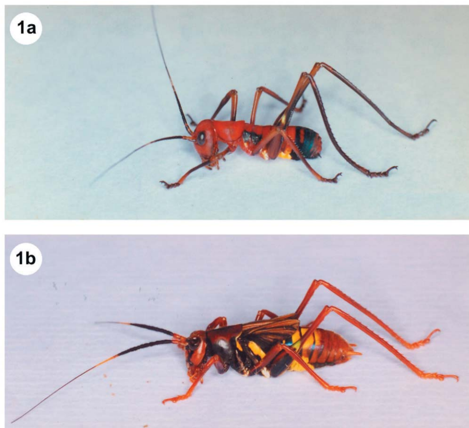
Fig. 1. Nymphs of S. nigra . a) third-stage nymph. b) fifth-stage nymph. For color version, see Plate II.

neo-XY sex chromosome mechanism does not differ in principle from that already described by McClung (1902, 1905, 1917), White (1951, 1953), Dave (1965), White et al. (1967), Fernández-Piqueras et al. (1982), Ferreira (1969, 1976), Messina et al. (1975), Alicata et al. (1974), and Hewitt (1979). There was a centric fusion involving a long acrocentric X chromosome, the biggest one of the set, which is totally heteropicnotic during the first prophase; the biggest of the second group was formed by acrocentric autosomes, giving rise to the biggest element of the set that becomes submetacentric and is now recognized as neo-X. Its bigger arm, the former X, is now called XL and the shorter, the ex-autosome of XR. The unfused autosome has become the neo-Y chromosome.