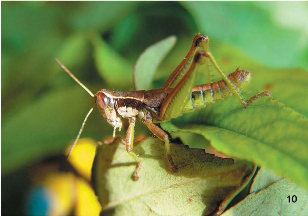
Figs 10-11. Huastecacris alexandri n. sp. Adult male (10) and female (11). For color version, see Plate VI.